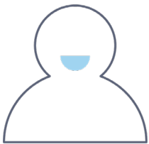
Large pool of experienced claims professionals

Whether you need colleagues for short-term or long-term assignments, we can quickly ramp up and provide the resources needed to manage the workload — no matter the size. We offer temporary support for various positions including desk adjusters, supervisors and managers, and administrative staff — helping you handle surge claim volumes and improve the customer experience.