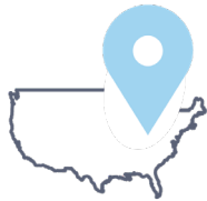
Available in all time zones nationwide