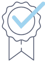
Licensing and skill sets aligned with your needs